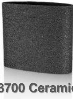
8700 Ceramic Abrasives